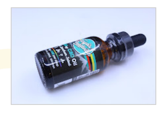
Unit: 1oz (28.5g) | Units Per Package:1

Analyzed via AAM-001 using Agilent 1220 HPLC-DAD. Limits are based on CO 6 CCR 1010-21. Sample was analyzed as received. Deviations from SOP: None.